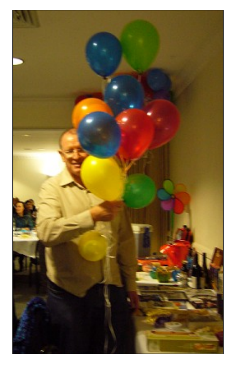
The balloon raffle and hamper raised $1335.

We were invited to be creative. Turn over for some of the limerick competition entries.